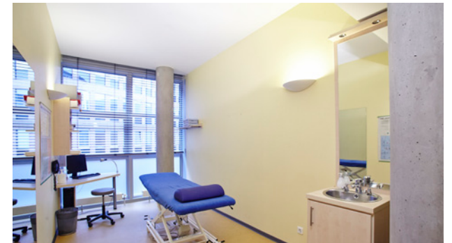
Physiotherapy treatment room